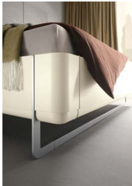
In cream white lacquer, Multibed cuts an elegant figure.

You can rely on chance when trying to find the perfect bed – or you can search systematically. With Multibed, all the versions and dimensions are compatible with one another but also with other Multi furniture from hülsta. This provides you with a maximum degree of choice: Different headboards and cover upholstery enhance the basic choice, besides lacquer colours and genuine wood veneers, there are also countless fabric and leather versions to choose from. Thanks to the flexible lying heights and optional storage space available, Multibed unites comfort and function intelligently to create a most convincing system – and more importantly: Your own personal dream bed.