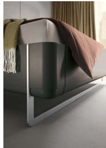
An elegant choice: Dark grey lacquer combined with a stylish arched support.