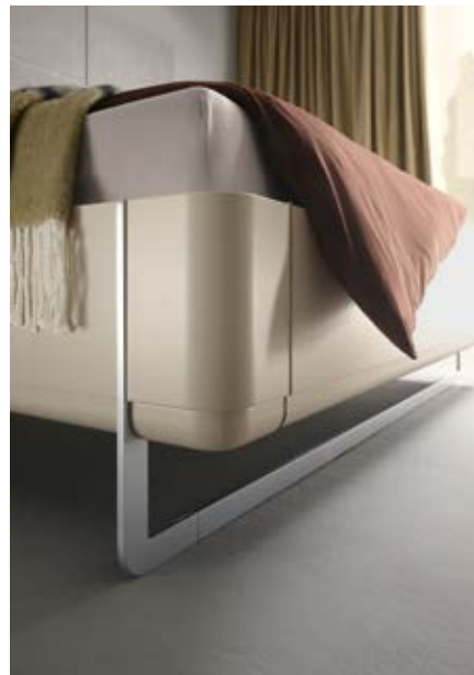
A Multibed in soft angora makes the bedroom as cosy as the name promises.